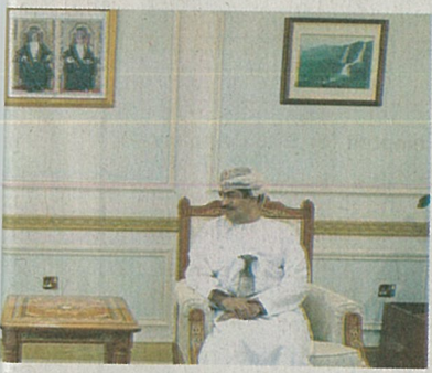
SHURA COUNCIL SESSION